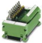
VARIOFACE switch module, with COMBICON connector, for simulation, for 8 signals, for mounting DIN rail NS 35

Interface module - UM 45-IB-DI/SIM8 - 2962997